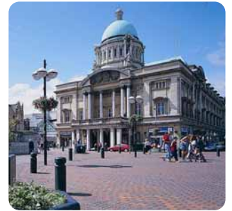
City Hall conference venue

The historic waterfront city of Kingston-upon-Hull lies in the heart of East Yorkshire. As England's third largest port, it has witnessed everything from the wool trade to whaling. In the past decade Hull has undergone a renaissance, becoming a hub for international trade with a particular focus on healthcare technology. With a new medical school and specialist hospital, Kingston-upon-Hull is an ideal setting for ASiT 2010. We look forward to welcoming you in March!