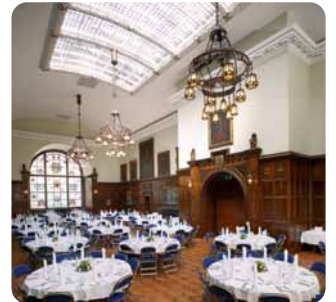
Guildhall Gala Dinner venue