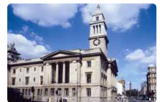
Guildhall Gala Dinner venue

Keep up-to-date on the ASiT website: www.asit.org