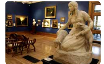
Feren's Gallery Civic Reception