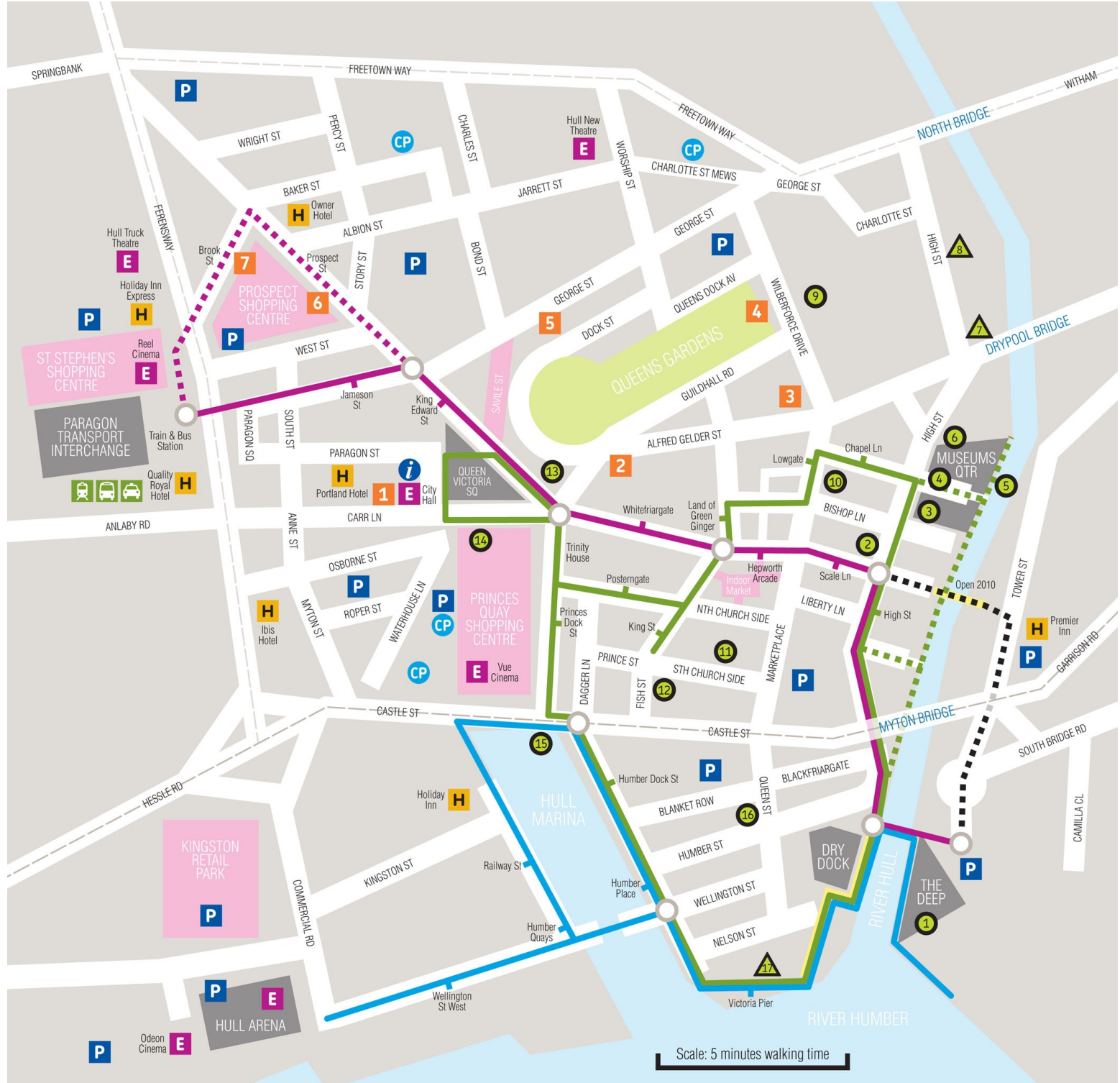
Scale: 5 minutes walking time